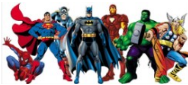
Pagan gods and idolatry